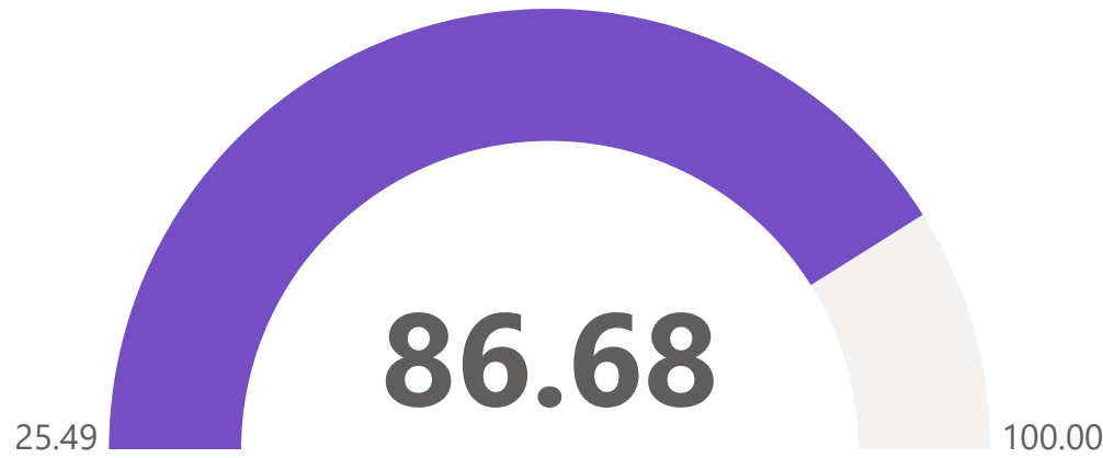
INTERLINK's Performance Model Score

Performance Scores are based on comprehensive data analysis, comparing all national transplant programs meeting INTERLINK volume requirements.