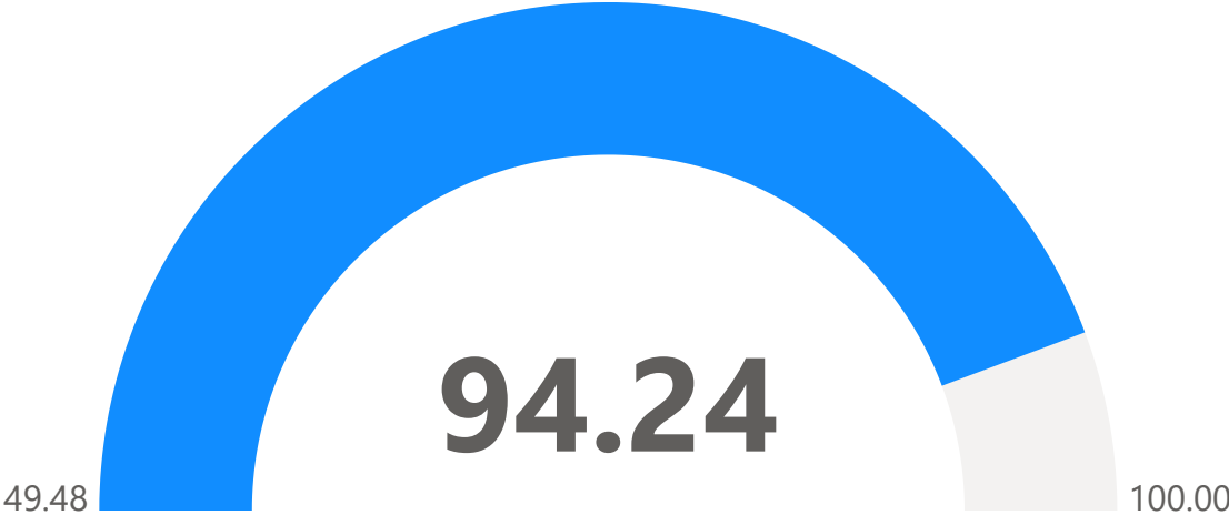
INTERLINK's Performance Model Score

Performance Scores are based on comprehensive data analysis, comparing all national transplant programs meeting INTERLINK volume requirements.