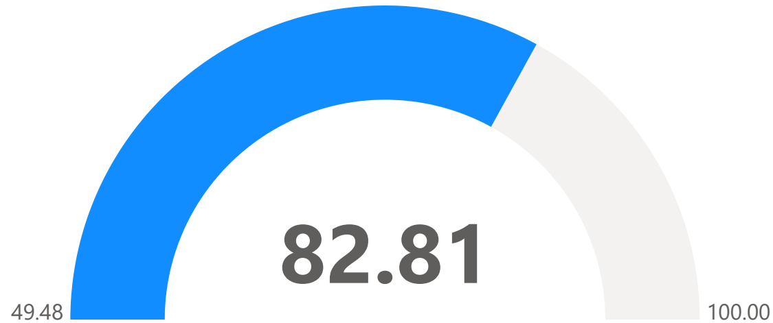
INTERLINK's Performance Model Score

Performance Scores are based on comprehensive data analysis, comparing all national transplant programs meeting INTERLINK volume requirements.